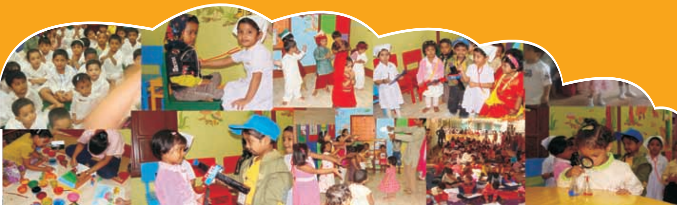
Actual Photographs of GK students