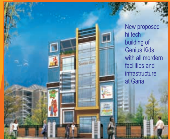
New proposed hi tech building of Genius Kids with all modern facilities and infrastructure at Garia

The Genius Kids has the "art of parenting" workshop for parents to give them the much needed support and guidance in parenting skills. Regular workshop for parents along with monthly information sheets that keep them in touch with the happenings in their kids classrooms. Also there is a unique parenting article every month, which gives them insight on parental issues.